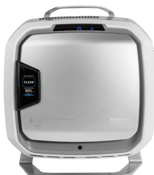
AM 3 PC & AM 3S PC