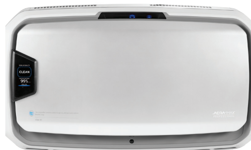
AM 4 PC - Wall mount